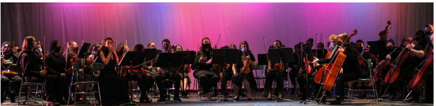
High School Instrumental Music Concert